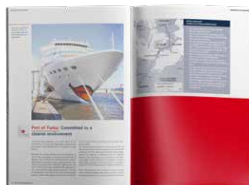
Insertion 1/2 page 210 x 145 mm 1,700.00 EUR