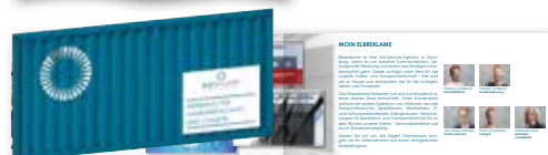
Inserts: Inserted loose for example 210 x 105 mm, 6-Page (specifications on request)