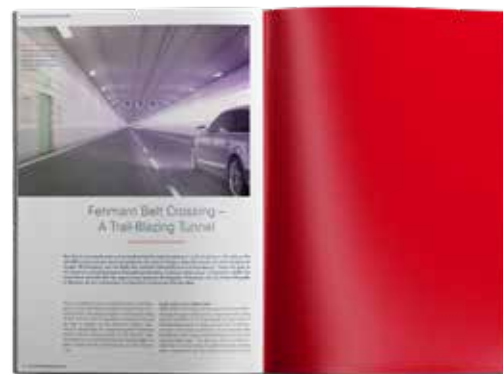
Insertion 1/1 page 210 x 297 mm 3,000.00 EUR

Bank: Hamburger Sparkasse IBAN: DE88 2005 0550 1048 2156 59 BIC: HASPADEHXXX