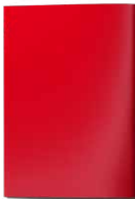
Insertion 1/1 page inside front/back cover, outside back cover 210 x 297 mm 4,500 EUR