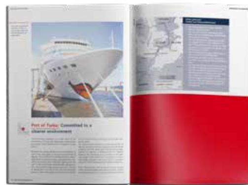
Insertion 1/2 page 210 x 145 mm 1,700.00 EUR