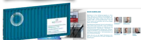
Inserts: Inserted loose for example 210 x 105 mm, 6-Pager (specifications on request)