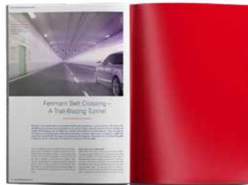
Insertion 1/1 page 210 x 297 mm 3,000.00 EUR

Bank: Hamburger Sparkasse IBAN: DE88 2005 0550 1048 2156 59 BIC: HASPADEHHXXX